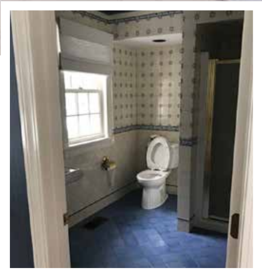
Removing all existing fixtures and tile was the first step in creating a bathroom with a larger glass-enclosed shower, improved lighting, and a serene feel.

and make it as easy as possible for the family, who lived a few hours' drive away, we assembled a talented team, from the contractor through key specialists and painters, to implement our designs and get the project rolling. We outlined the renovations with detailed construction plans, lighting and plumbing placements, and tile and fixture specifications.